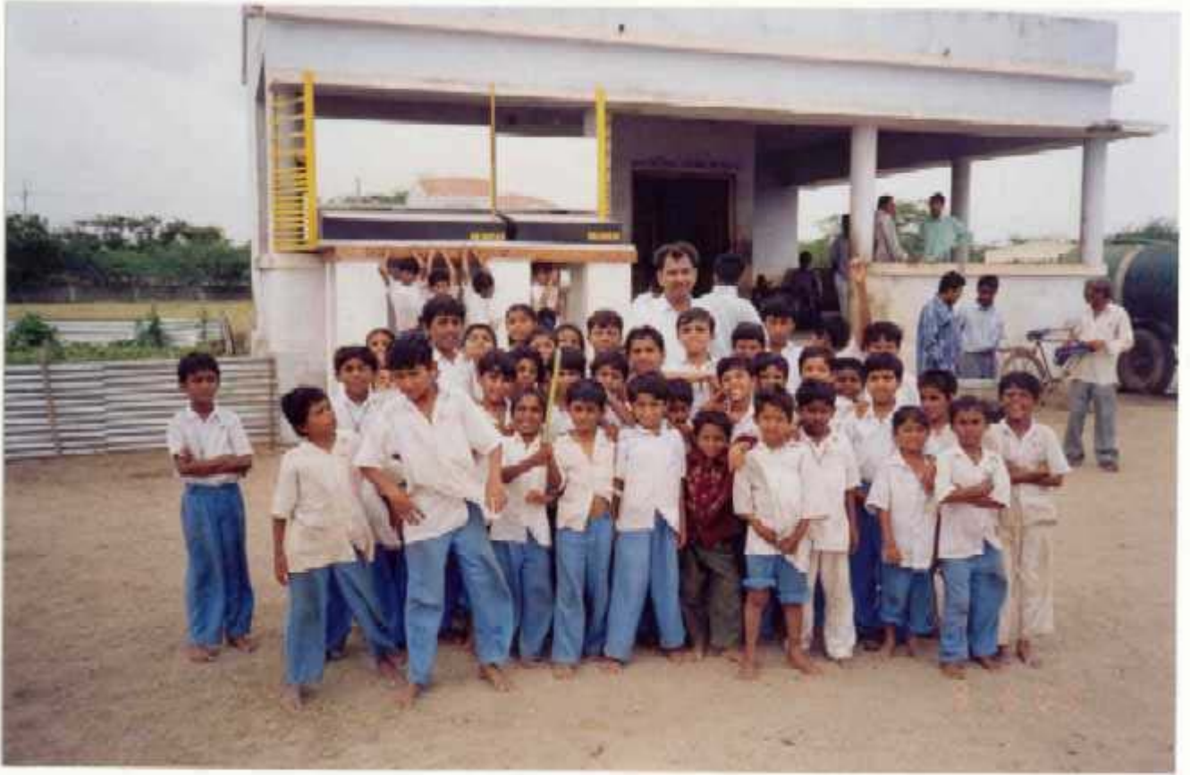
Figure-2 : School Children in front of SolCafe