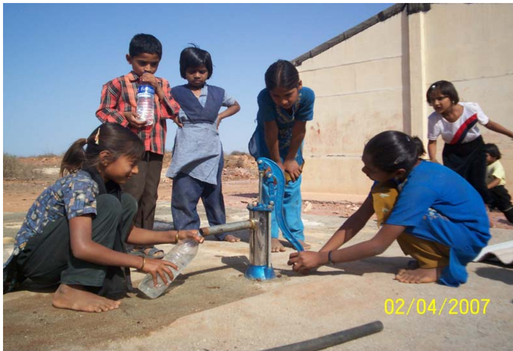
Figure 6: School Children Drawing Dew Water – Satapar