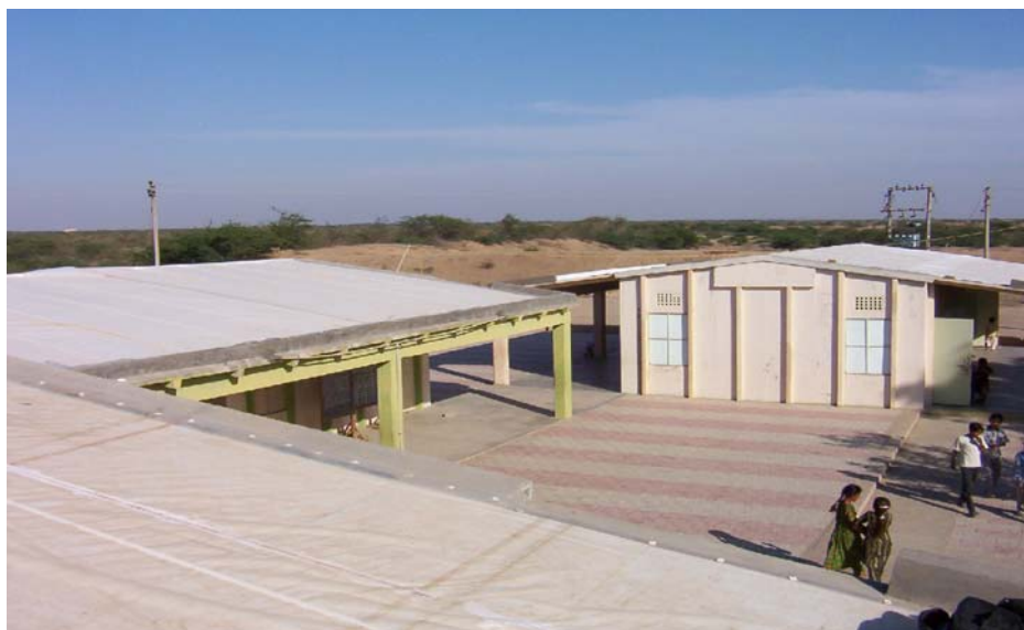
Figure 3: Dew Harvest System at Sayara (CoR)