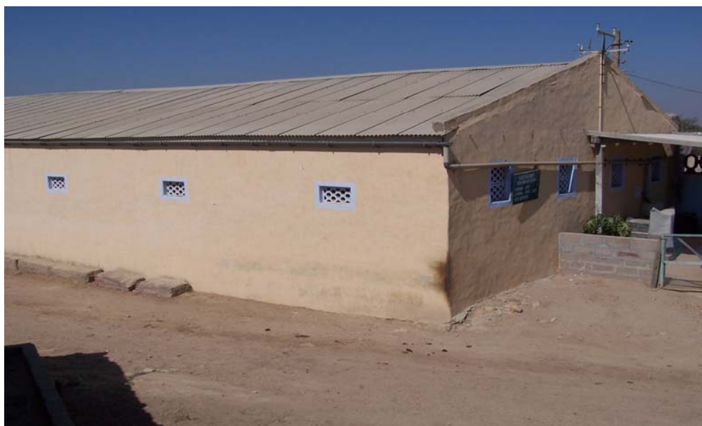
Figure 4: Dew Harvest System at Suthari (RaC)