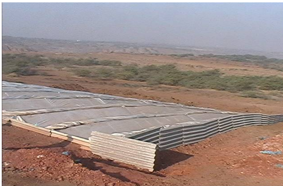
Figure 5 a: Dew Harvest System at Panandhro (CoG)