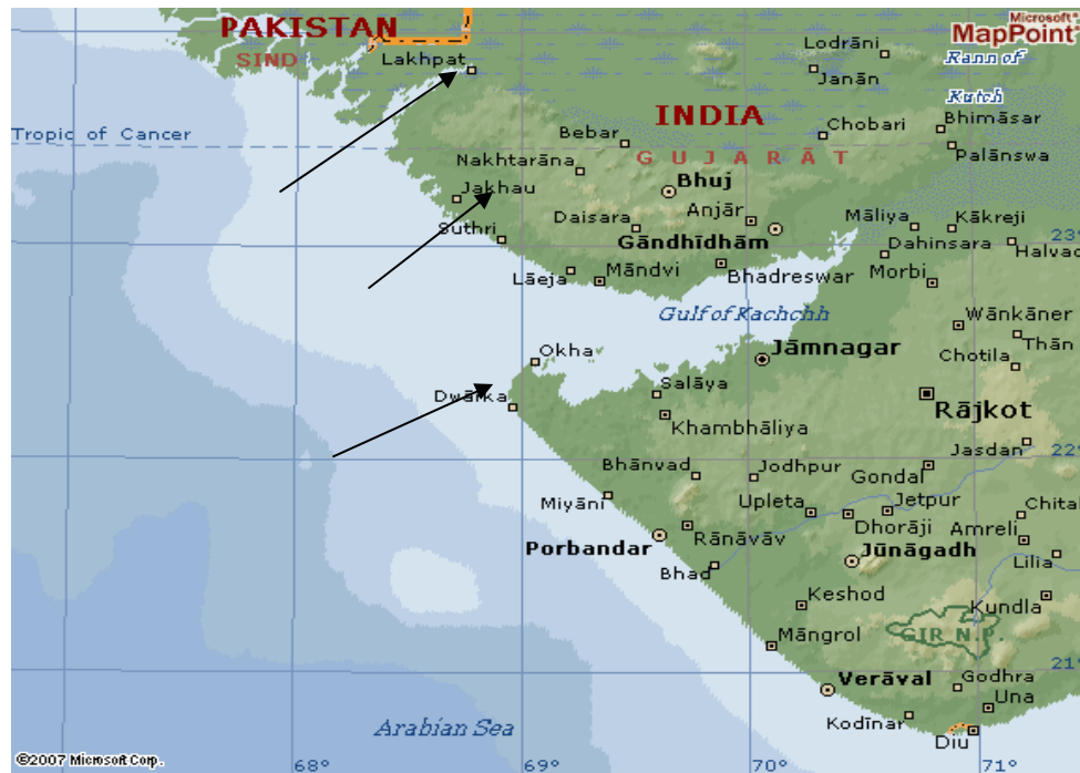
Figure 1: Coastal Arid Region of Gujarat

Arrows indicate sites where dew measurement was made ( Panandhro , Kothara , Mithapur)