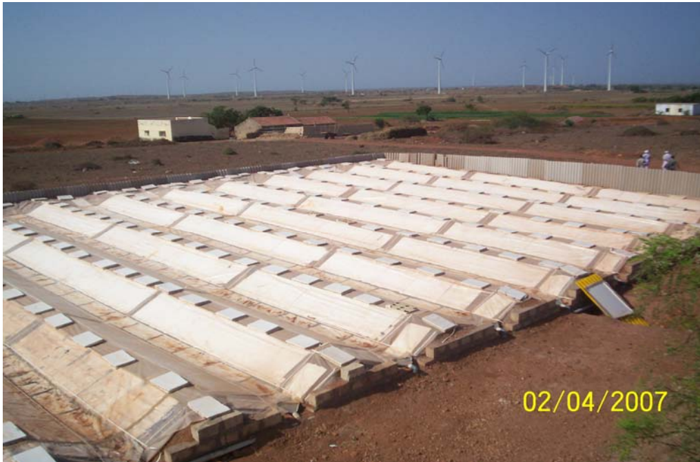
Figure 5 b: Dew Harvest System at Satapar (CoG)